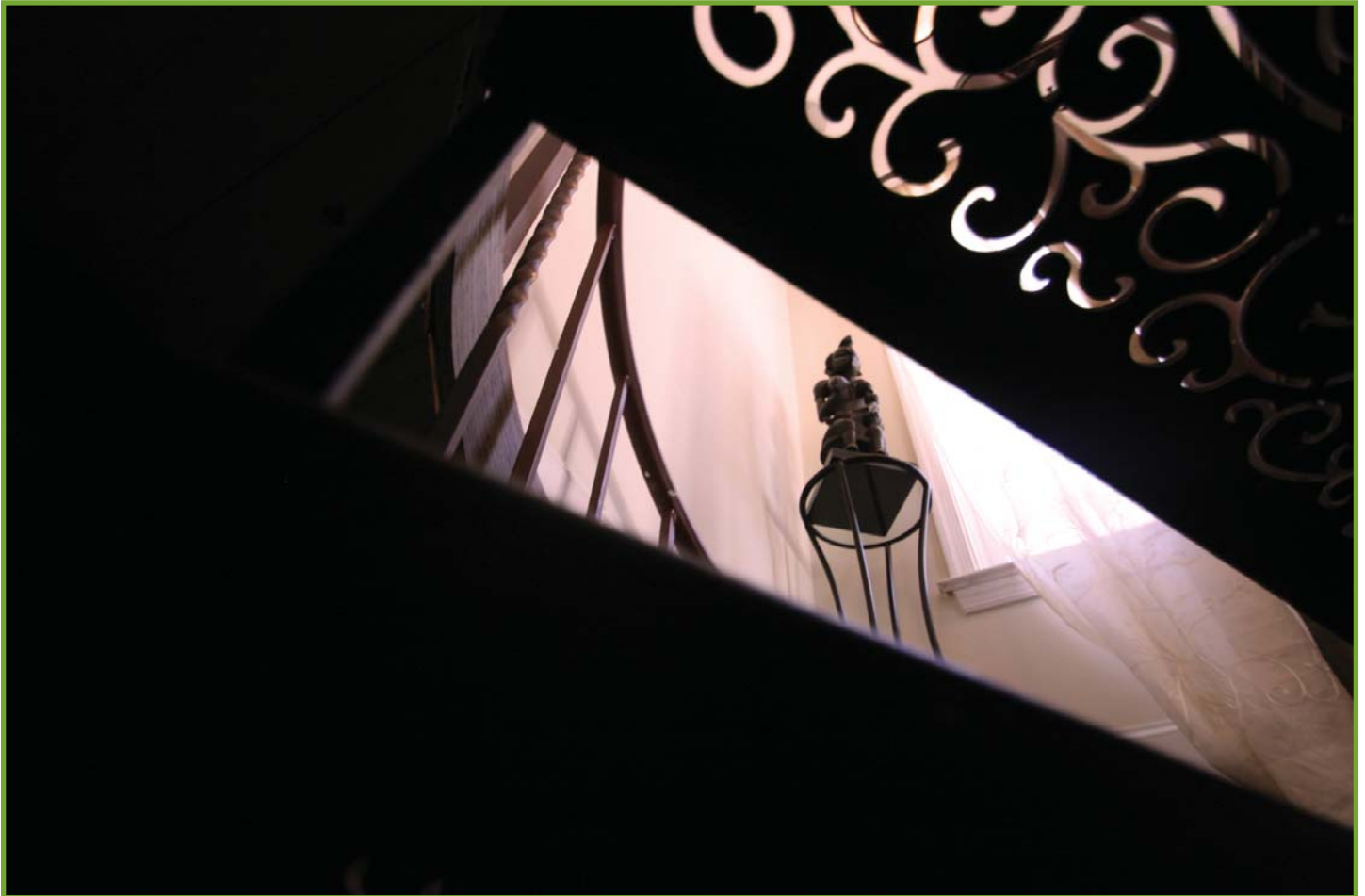
Spiral stair in wine cellar/den - Residential - Design/Build

1744 Taylor St, NW Washington DC 20011 202.882.8139/O 202.882.8188/F