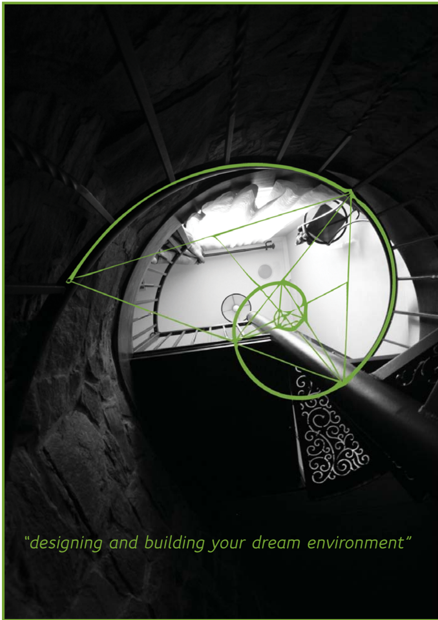
Spiral stair in wine cellar - Residential - Design/Build