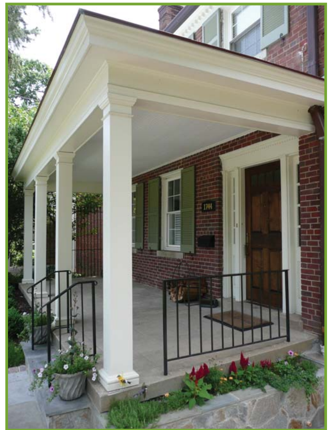
Front porch restoration (80% demo + rebuild) - Residential - Design/Build